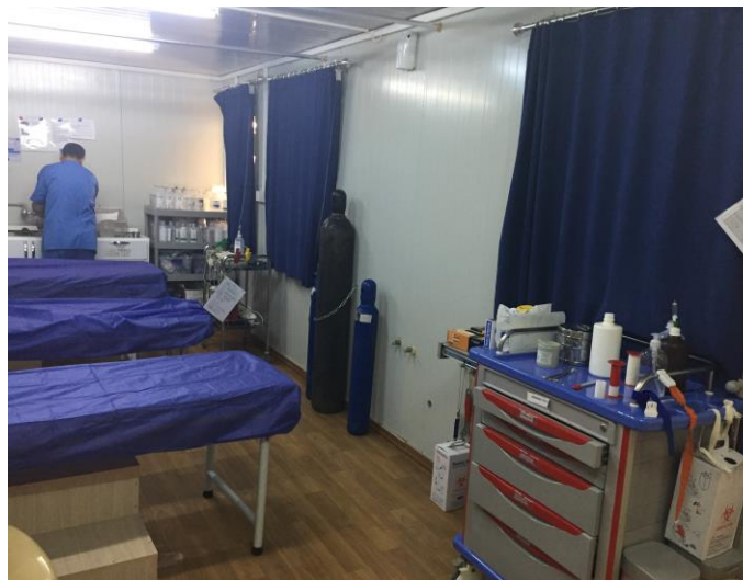
Stabilization room, Arbat refugee camp PHCC, Sulaymaniyah