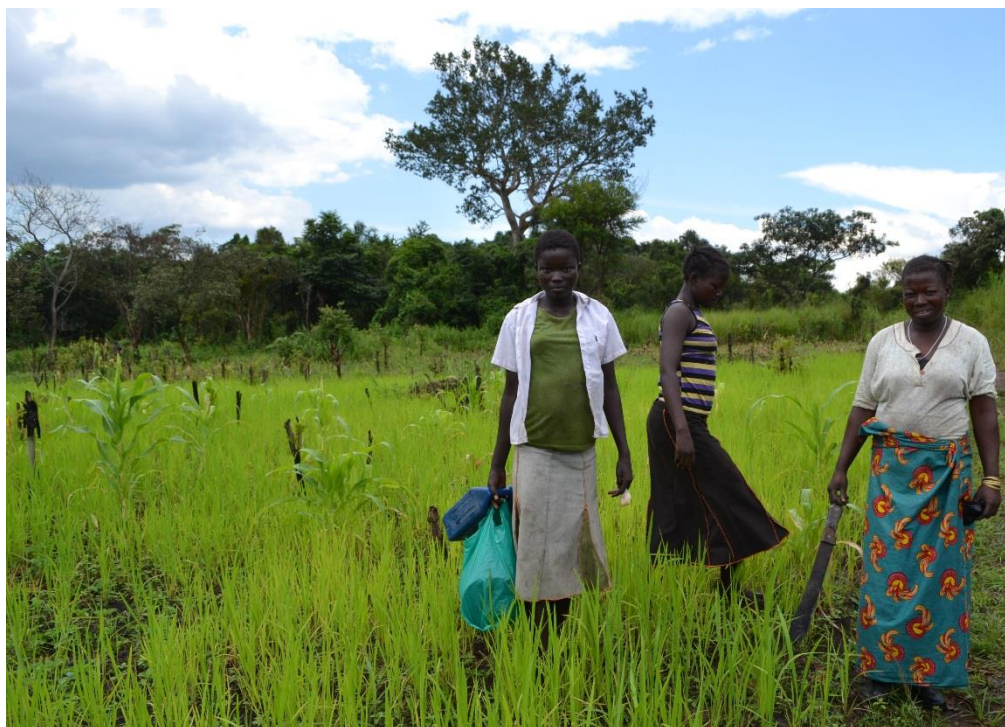
Refugee women increasing their self-sufficiency by working their paddy fields at the Biringi site August 2017