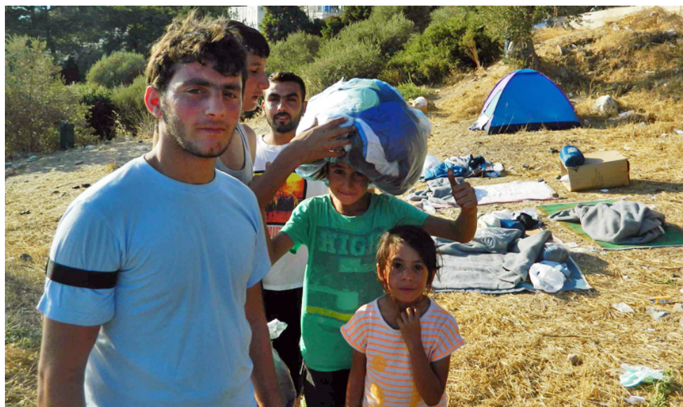
Asylum-seekers resort to sleeping outside the overcrowded reception and identification centre of Vathy, Samos as the centre's capacity is not sufficient to accommodate all. August 2017.

6 Island Offices in Lesbos, Chios, Samos, Leros, Kos, and Rhodes