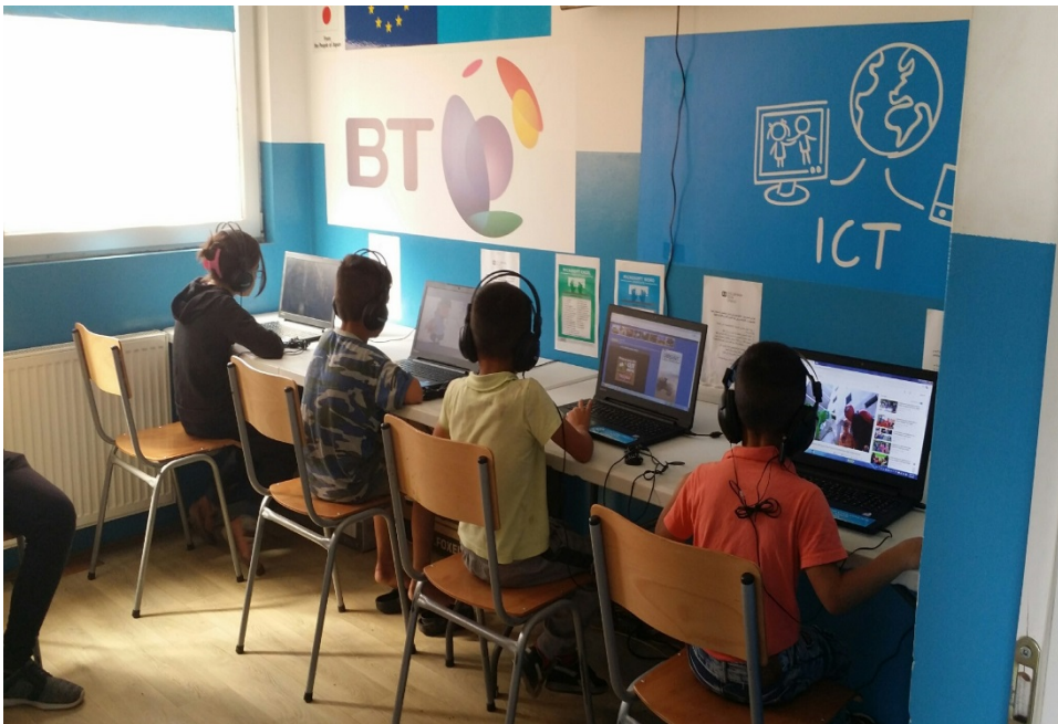
SOS CV IT Corner in Adaševci TC (Serbia), 5 September 2017