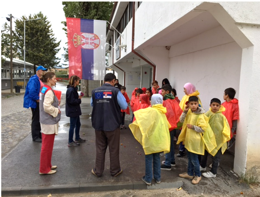
Children lining up to go to local school, Preševo RC (Serbia), 20 September 2017

232 asylum-seekers were admitted under the regular procedure into Hungary in September.