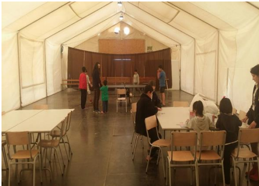
Rub-hall in Principovac (Serbia), previously used for accommodation, now serving the need for recreational activities, 31 Oct 2017

TCs in the West sheltered 543 refugees and migrants: 367 in Adasevci and 176 in Principovac.