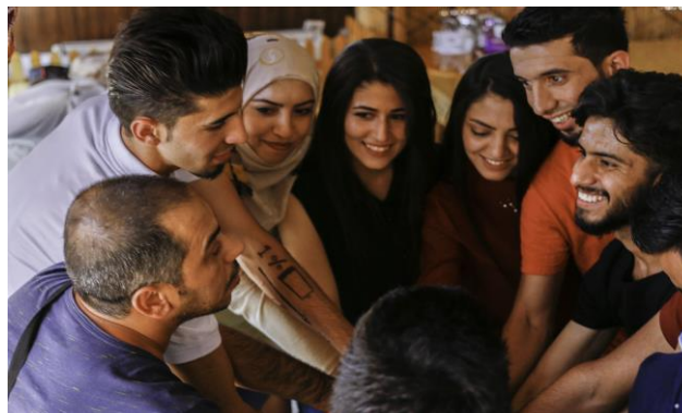
Theatre Show, Amnasuraka museum, Sulaymaniyah governorate, 2017

The Iraq Real Time accountability Partnership (RTAP) team held meetings to finalize the steps for the launch of the implementation of action framework and terms of reference for the RTAP advisor.