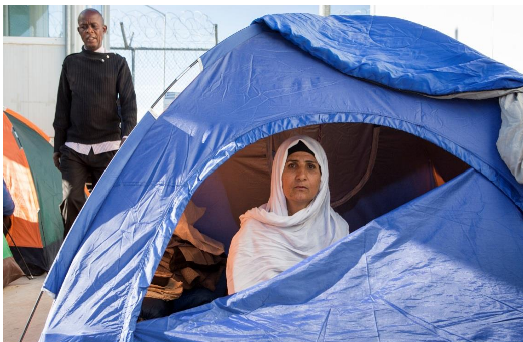
Refugee woman in Moria RIC, Lesvos.

1 Islands Unit in Athens 1 Sub Office on Lesvos 5 Field Offices on Chios, Samos, Kos, Leros and Rhodes