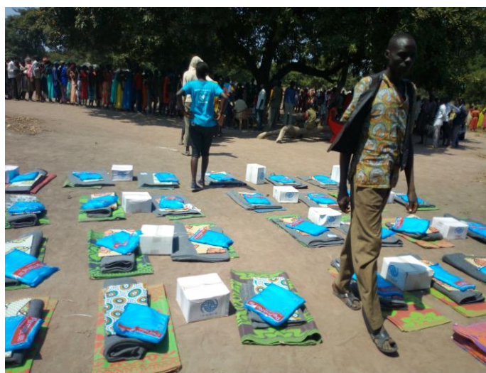
Persons with special needs (PSNs) receive Non-food items in Lake's Cueibet County.