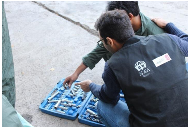
Vocational trainings for UASCs taking place in the Community Center and local businesses in Belgrade, @ADRA, October 2017