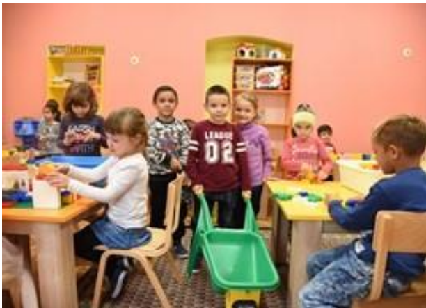
New premises of "Maslačak" kindergarten, Kikinda (Serbia), @UNDP, October 2017