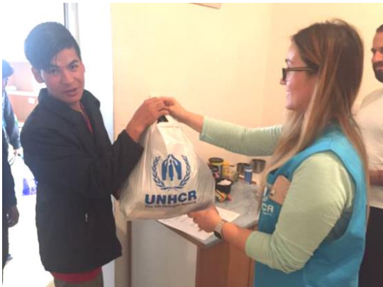
Distribution of winter clothes, Subotica (Serbia), ©UNHCR, 19 Oct 2017