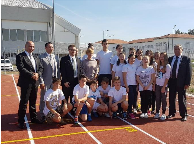
Official Handover ceremony of the Lajkovac Sports Court (Serbia), October 2017