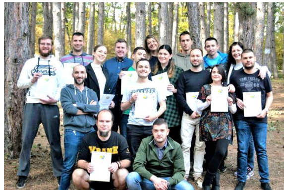
Training of Trainers - Welcome Initiative for Refugee/Migrant Youth (CARE, NEXUS, NSHC and VCOS), in Divljana (Serbia), October 2017