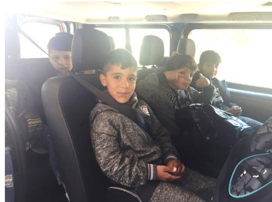
School transportation, Vranje (Serbia), 25 October 2017