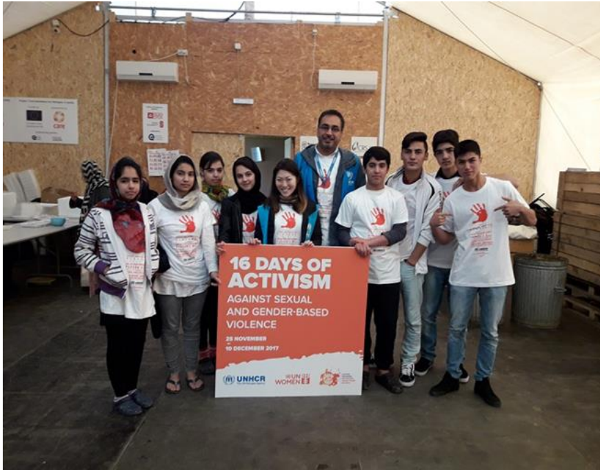
Marking the 16 Days of Activism, through discussions with girls and boys in Principovac TC, (Serbia), 27 Nov 2017