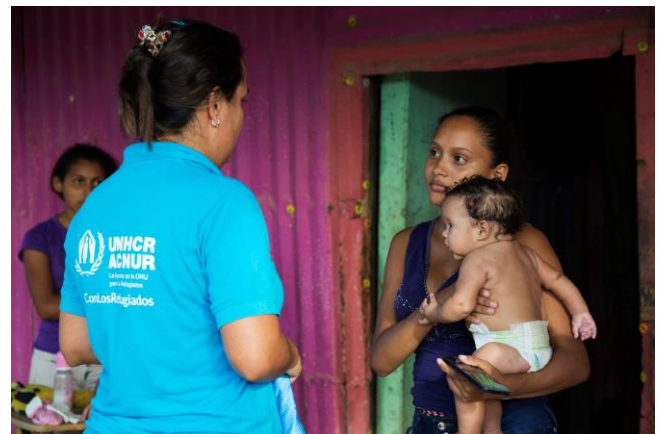
UNHCR conducts a follow up visit to a Venezuelan family waiting for a decision on their asylum application in Arauca, Colombia.