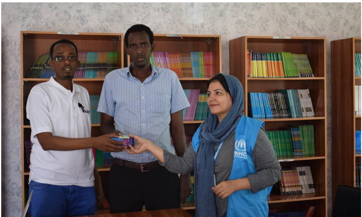
UNHCR distributed a mobile phone to a Yemeni refugees for providing subsistence allowances.

As part of the enhanced return package, 137 Somali returnees (70 households) received one-time reinstallation grants in November in order to restore their lives upon return home.