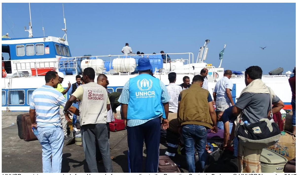
UNHCR receiving new arrivals form Yemen before proceeding to the Reception Centre in Berbera.