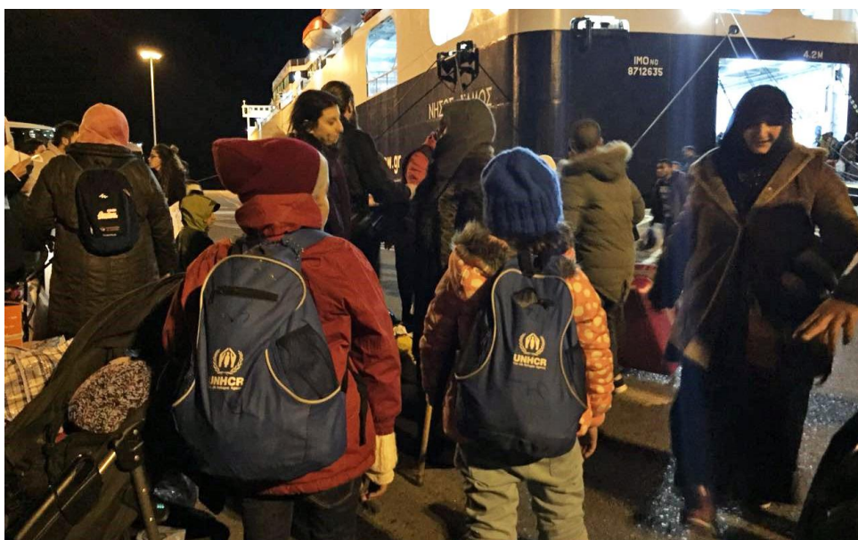
UNHCR supports transfer of 262 asylum-seekers from overcrowded Moria RIC on Lesvos to apartments in Crete.