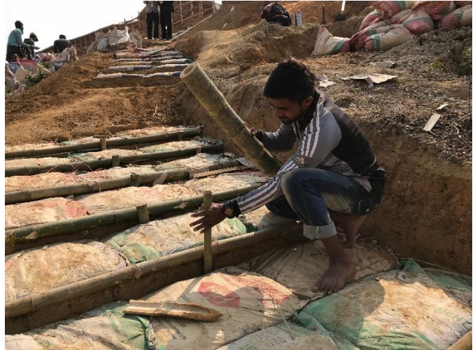
UNHCR has already taken a number of steps to better protect refugees ahead of the monsoon season.

Planning and preparedness ahead of the monsoon continues to be the main priority for all actors in Cox's Bazar District. Key services in the settlement are also at risk of being washed away, including latrines, washrooms, tube wells, and health centres. Families are being provided with upgraded shelter kits, including biodegradable sandbags to help to anchor the structures, which are sturdier and can better protect them in heavy rains. Several engineering projects are also underway to build bamboo-reinforced footpaths and stairs, raised bridges, bamboo/brick/concrete retaining walls for soil stabilization and drainage networks. Families most at risk will be encouraged to relocate to