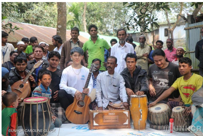
UNHCR Goodwill Ambassador MIYAVI jams with some Rohingya musicians in Kutupalong refugee settlement

UNHCR continues to support the GoB's efforts in providing protection and assistance to all refugees. UNHCR's main government counterpart is the Ministry of Disaster Management and Relief (MoDMR). In Cox's Bazar, UNHCR cooperates with the Refugee Relief and Repatriation Commissioner (RRRC), the local representative of the MoDMR.