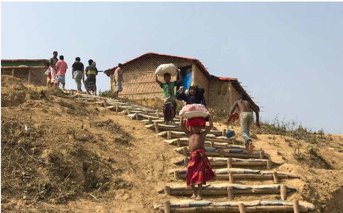
Monsoon rains could put protection of Rohingya refugees at risk. UNHCR has already taken a number of steps to better protect refugees.

A Joint Response Plan, covering the period from March to December 2018, is under preparation.