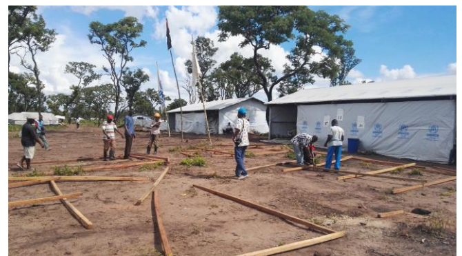
Lóvua Settlement, Training of refugees on shelter building. December 2017