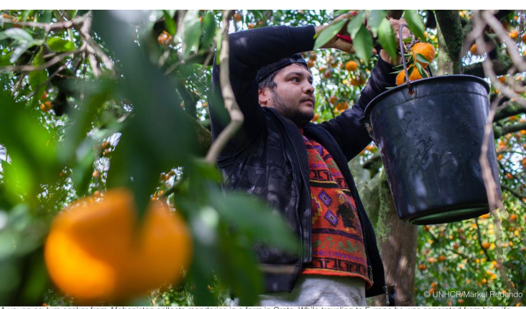
A young asylum-seeker from Afghanistan collects mandarins in a farm in Crete. While traveling to Europe he was separated from his wife and son. He now lives with his mother in Chania, thanks to UNHCR's accommodation programme which accommodates some 700 refugees on the island of Crete.