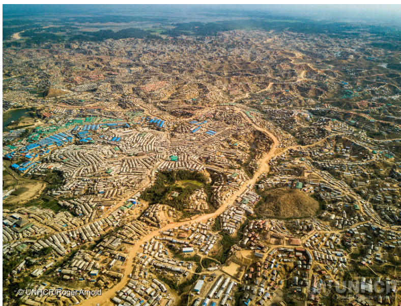
Aerial view of Kutupalong refugee settlement.

Refugees have settled in Cox's Bazar District, mainly in Kutupalong and Nayapara settlements. Kutupalong is more hosting more than 586,000 refugees, making it the world's largest refugee settlement. This settlement can be compared to city, with a population equivalent to Glasgow (UK) but an area 12 times smaller. While the Government of Bangladesh, with the support of UNHCR and its inter-agency partners has mounted a significant response in the past six months, conditions remain overcrowded and precarious.