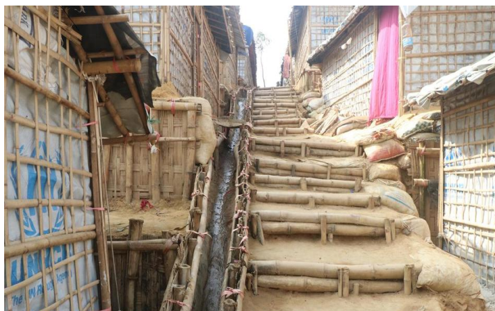
Monsoon preparedness is on-going to strengthen stairs and houses.

In the past weeks, preparations ahead of the monsoon season have been accelerating to mitigate the risk of an “emergency within an emergency”. Small engineering projects continue in the settlements to build bamboo reinforced footpaths and stairs, raise bridges, and to build retaining walls for soil stabilisation and drainage networks. UNHCR is also pre-positioning 35 containers with post-cyclone relief items at distribution points across Kutupalong and Nayapara settlements.