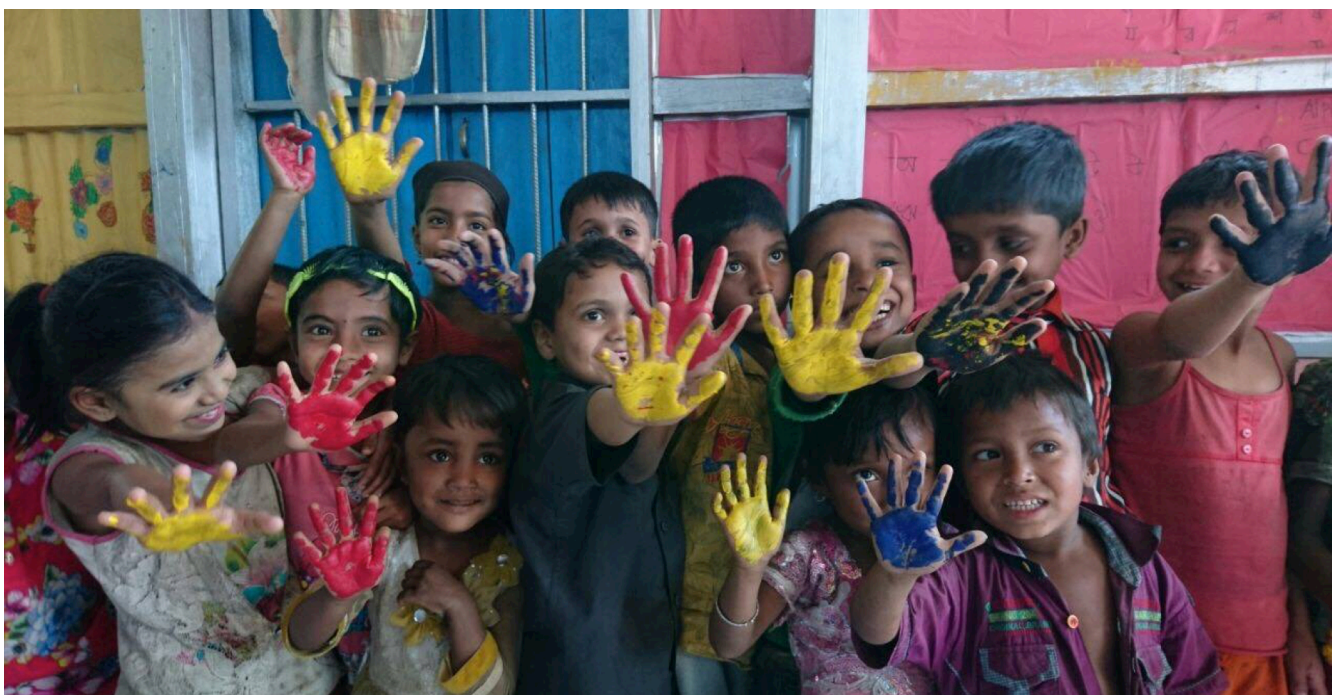
Youngsters at a child-friendly space in Nayapara refugee settlement run by UNHCR and partner Save the Children.

A Joint Response Plan, covering the period from March to December 2018, is under preparation.