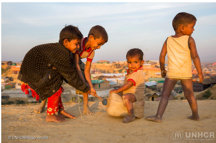
Refugee children playing in Kutupalong settlement.