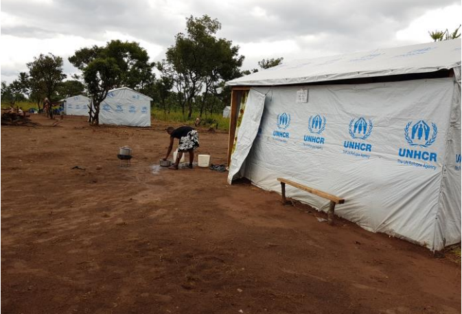
Village F1,Family Shelters, February 2018