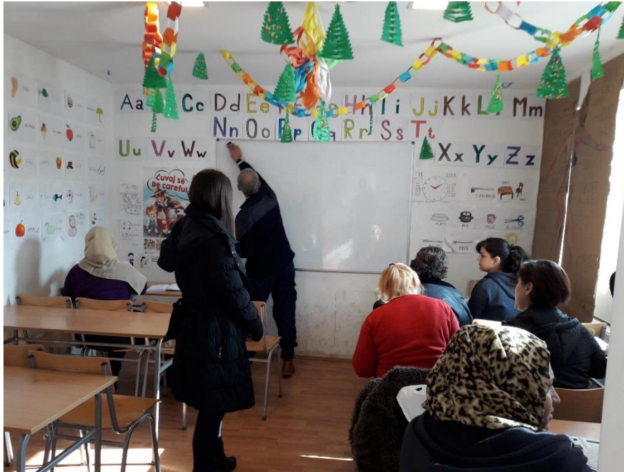
Language classes for refugee women, Adasevci (Serbia), ©UNHCR, 19 February 2018