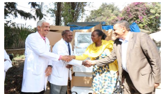
UNHCR handed over 4 haemodialysis machines to St. Paul Hospital.

Sub-Offices- Melkadida, Gambella, Shire, Assosa and Jijiga