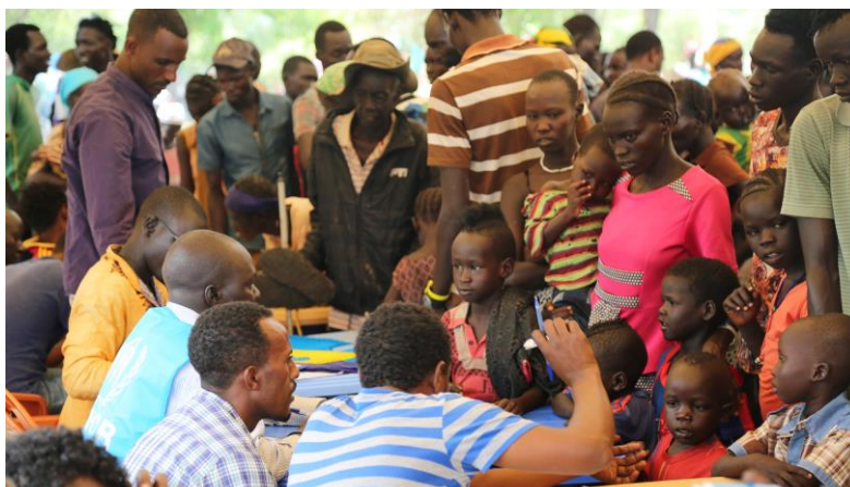
Initial registration of newly arriving South Sudanese refugees at the Pamdong transit centre.