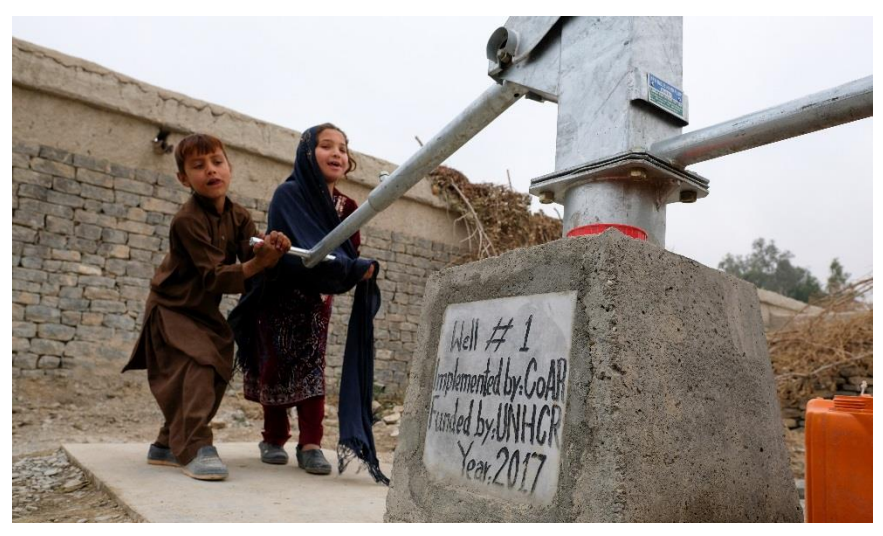
Pakistani refugee children collect water from a hand water pump well built by UNHCR and partner Coordination for Afghan Relief (CoAR) in Khost province.

To address protection risks arising from a lack of potable water and sanitation, UNHCR and partners have implemented WASH projects in Khost and Paktika provinces, including the construction of wells and latrines for the refugee population. Through community based projects, UNHCR installs establishes water wells. WASH facilities, distributes hygiene kits and hygiene awareness promotes campaigns to bring desired change in attitudes and practices amongst the refugee community.