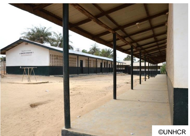
(L) Bahn High Extension School students show their grade cards. (R) Bahn High Extension School fully renovated