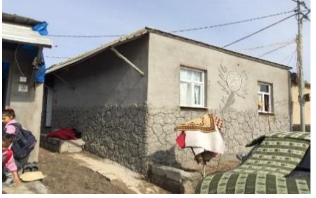
Upgrading shelte in Domiz 1 camp

Out of camps, 90 % of households in the KR-I host community were renting house or apartments. Provision of adequate and targeted shelter support to refugees residing out of camps requires increased attention as needs remain very high.