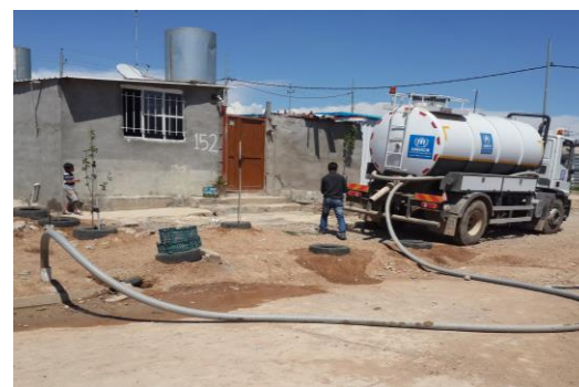
Desludging in Domiz 1 Camp, Duhok

Duhok: The new strategy to increase community participation and involvement in the care and maintenance of WASH facilities at the household levels continued; thus, BRHA has focused more on the maintenance of public facilities. UNICEF continues to work closely with BRHA for incremental cost reduction of care and maintenance.