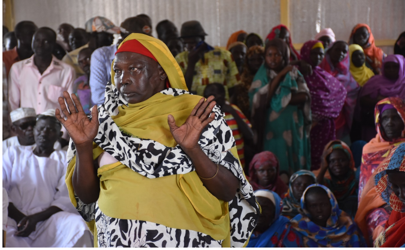
South Sudanese refugee woman shares her concerns at a meeting with the refugee community living in Beilel IDP Camp on 23 April in South Darfur.

GAPS ANALYSIS OF SGBV SERVICES CONDUCTED FOR REFUGEE COMMUNITIES IN EAST DARFUR – An inter-agency team led by UNHCR on sexual- and gender-based violence (SGBV) recently completed a gaps analysis of available services in East Darfur. Major gaps identified in referral pathways include: a lack of coherent case management procedures and mechanisms, as well as gaps in psychosocial support and access to justice. SGBV health service coverage is reportedly sufficient across key settlement and camp areas. The analysis also identified the need to prioritize economic empowerment activities within camps and near settlements for women to reduce women's vulnerability to SGBV incurred by traveling long distances for work opportunities. More detailed findings will be shared via the state's RWG.