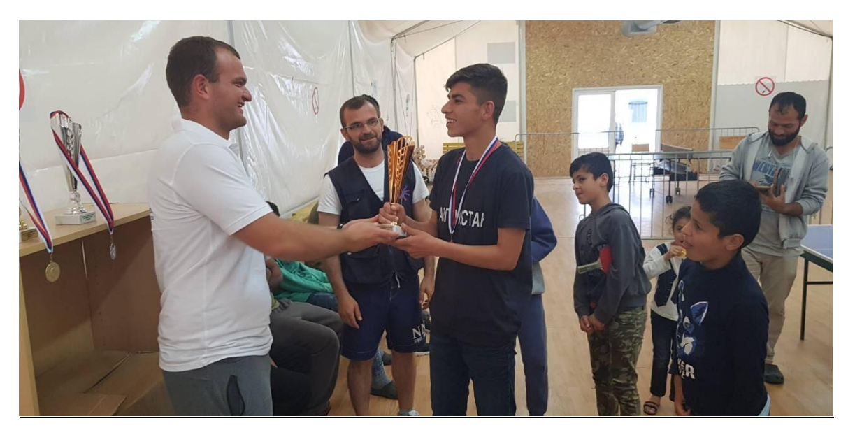
An Afghan refugee boy wins a table tennis tournament in Presevo RC, 14 May 2018