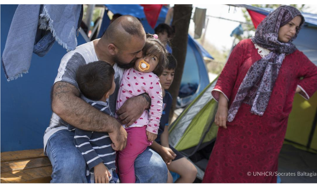
An Iraqi family at the Diavata site near Thessaloniki. The family crossed into Greece via the Evros River.