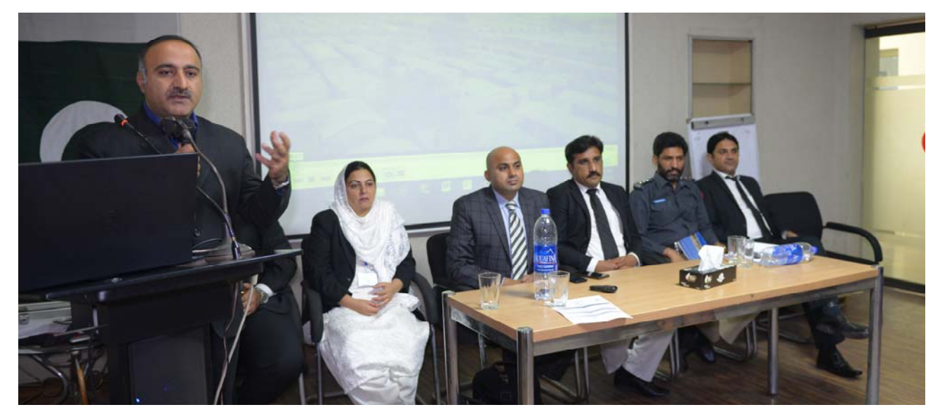
Training for Police officials by SHARP and UNHCR, Lahore, Pakistan