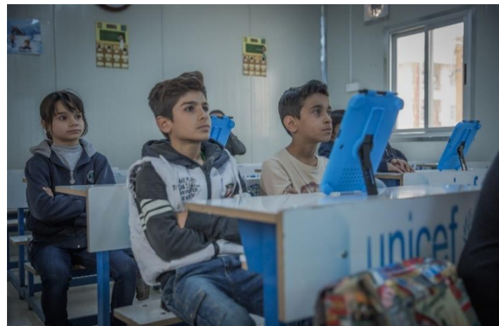
Students attending E-Learning Program

General directorate of Education in Sulaimaniyah were supported to provide incentives of March to 238 volunteer teaching and non-teaching staff (69 males & 169 females) in 8 Syrian refugee schools of Sulaimaniyah. The total number of children who benefit is 3,555 (1,753 girls and 1,802 Boys).