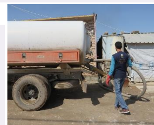
Care & maintenance of sanitation facilities in Domiz 1, Duhok

Erbil: Water and sanitation facilities being upgraded in Kawergosk Camp, this included construction of additional 274 family WASH facilities (full package) . The facilities upgrade include super structures (Toilet & Showers), Water Supply System (Main & Networks) with HDPE (High-density polyethylene) Roof Tanks, underground Sanitation facilities (Separated Sewerage Pipelines, Septic Tanks & Cesspool, and Grey Water Pipelines with connections to main sewerage systems).