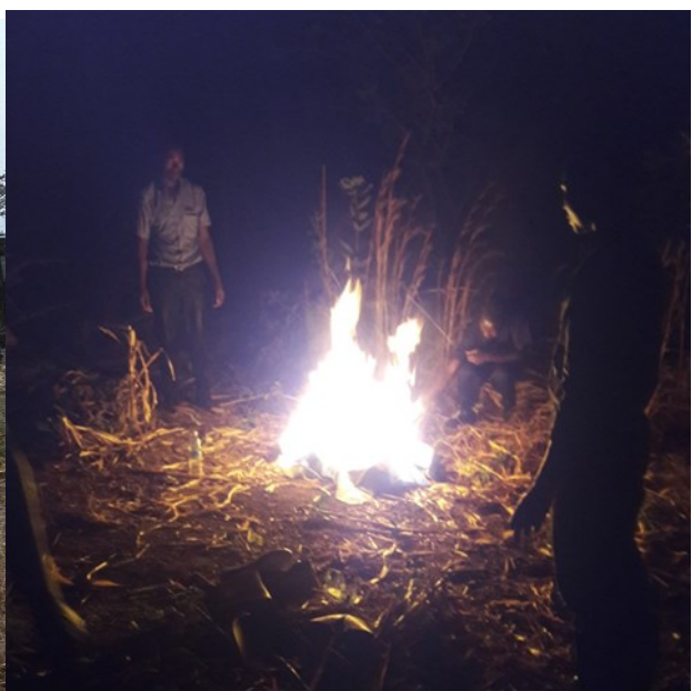
@Supervised burial of a suspected VHF case by Arua EPR team, Iyete, Bidibidi