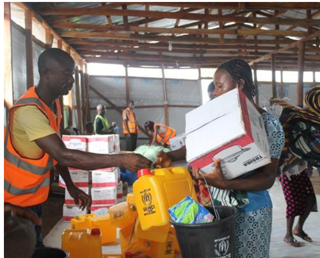
Cameroonian refugees receiving non-food items upon their arrival to Anyake settlement, Benue State © UNHCR / C. Cavalcanti.

Cameroonian refugees relocated to Anyake settlement, Benue State (as of 15 th June 2018)