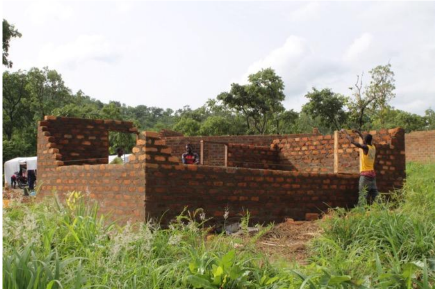
Cameroonian refugees building their shelter in Anyake settlement, Benue State