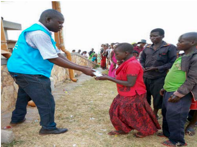
Congolese new arrivals receive water and high-energy biscuits at Sebagoro, Uganda.