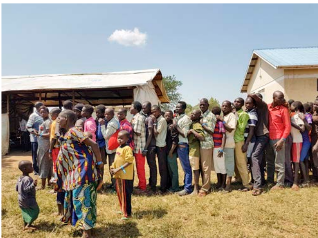
Congolese new arrivals line up for food distribution at Kagoma reception centre, Uganda.