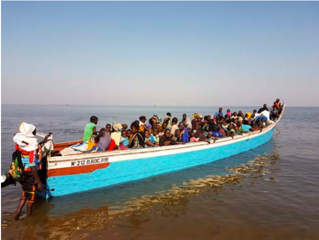
Boat arrivals from DRC at Sebagoro, Uganda.