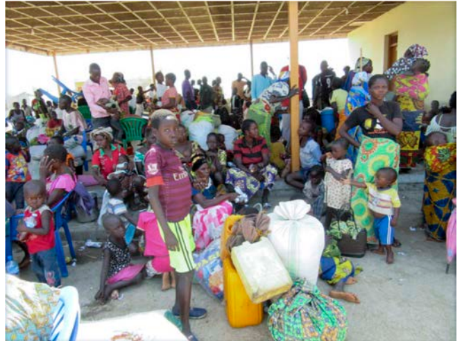
Congolese new arrivals at Sebagoro waiting area, Uganda.