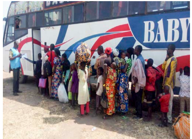
Congolese new arrivals board a bus for relocation to Kyangwali settlement, Uganda.