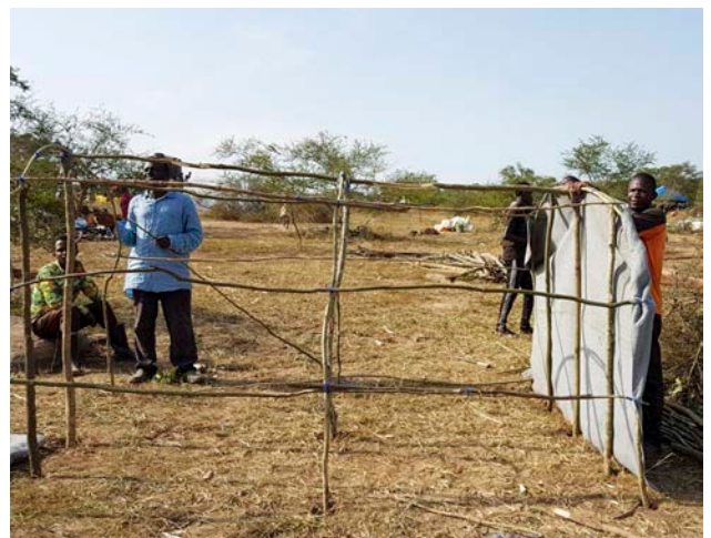
A Congolese new arrival builds a shelter for his family in Marembo C, in Uganda's Kyangwali settlement.