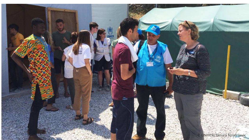
UN Deputy High Commissioner for Refugees Kelly T. Clements meets new arrivals at UNHCR's transit site in the North of Lesvos Island