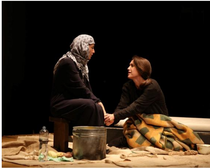
Play “If Only I was not a Woman”, based on an Afghan refugee story, Belgrade National Theatre @IAN, 26 June 2018