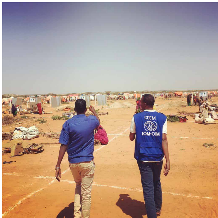
IDP site planning in Dolow, Muse/IOM 2018