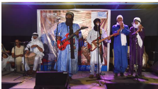
The Taflist, a refugee band from Mbera camp, performing in Noakchott during the celebrations for the Word Refugee Day.

On the occasion of World Refugee Day, UNHCR Mauritania held commemorations in Mbera camp and in the cities of Nouakchott and Nouadhibou. On 18 June, UNHCR, in collaboration with the French Institute in Mauritania, held its kick-off event for World Refugee Day in Nouakchott with a movie-debate . On 20 June, UNHCR and its local partner ALPD organized a series of community activities in Nouakchott and Nouadhibou, and a Malian refugee band performed in the evening at the French Institute of Nouakchott. On the same day, UNHCR in Bassikounou commemorated World Refugee Day in Mbera camp. The closing event was hosted by the University of Nouakchott where UNHCR organized a movie projection followed by a debate with students at the Faculty of Law and Economics.