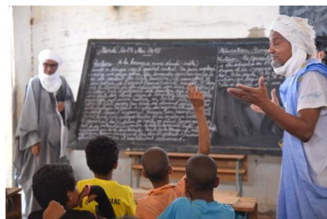
Children answering their teacher in one of the six schools in Mbera camp

In Mbera camp, UNHCR and Intersos continue to carry out adults' literacy courses in the main four languages of the camp (Tamashek, Arabic, Songhai and Fula). In June, 255 students (199 women and 66 men) took the final exam.