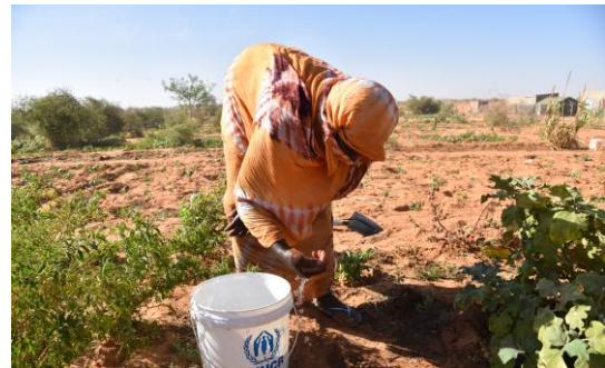
Refugee woman working in her garden nearby Mbera camp

Refugees in Mbera camp are dependent on food assistance due to very scarce local resources. UNHCR works with partners to improve access to gardening fields and livestock to reduce refugees' dependency on food assistance. Development interventions are needed in the Hodh Echargui region to help both refugee and host communities become more resilient.