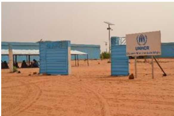
UNHCR Protection office in Mbera camp.

A total of 58,923 people are assisted by UNHCR in Mauritania.