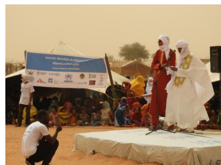
Celebrations of the World Refugee Day in Mbera camp.