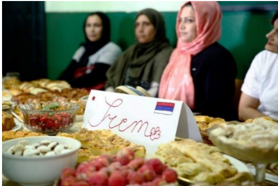
International Family Day celebration in Adaševci (Šid), May 2018

protection lecture organized by the Secretariat for Environment Protection of the City of Kikinda. This friendly gathering involved a soccer match and tasting of some traditional Voivodinian dishes. This activity was realized within the framework of EU support to municipalities hosting migrants.