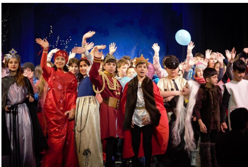
Refuge/migrant children perform “Snow White and the Seven Dwarfs” within UNICEF-supported creative workshop in Kikinda Transit Centre

Hungary continued to admit 10 asylum-seekers per week on average. In Apr-June, 129 asylum-seekers were admitted into procedures in the so-called “transit-zones” of Hungary (compared to 269 in Jan-March). IOM assisted the repatriation of 65 migrants through assisted voluntary return (AVR) and UNHCR the resettlement of 13 refugees.