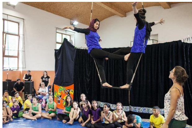
The “Lollipop Circus” Show, Šid, @IDC, June 2018