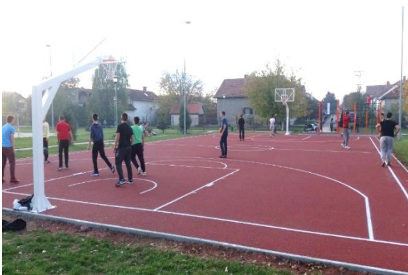
New basketball pitch near “Branko Radičević” School, Šid, May 2018

from Principovac TC for them to be able to attend the show.