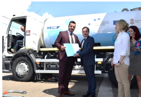
EU-donated water cistern, Sjenica municipality, @UNDP, July 2018