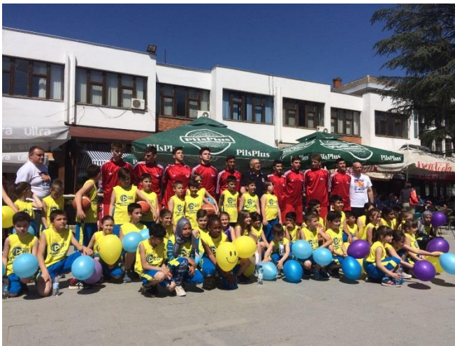
Basketball tournament in Bujanovac, 16 April 2018