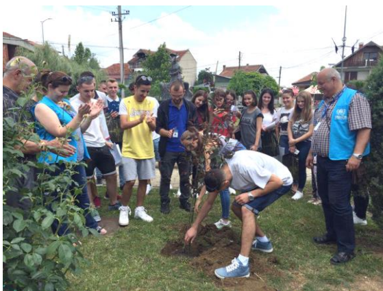
Joint planting of trees in “Skenderbeu” Secondary School in Preševo, on the occasion of World Refugee Day, @UNHCR, 20 June 2018

future activities aimed at improving their knowledge and skills.