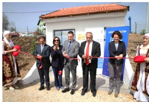
Official opening of Water Reservoir in Tutin, @UNDP, April 2018