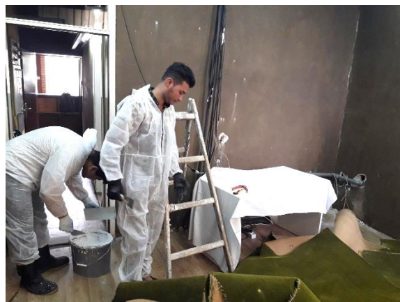
GIZ/NSHC construction/painting workshop in Adaševci Tranist Centre, @UNHCR, 20 April 2018