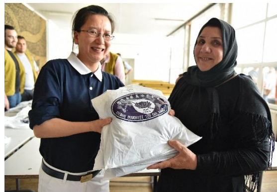
Distribution of summer clothes in Adaševci Transit Centre (Serbia), @Tzu Chi, May 2018