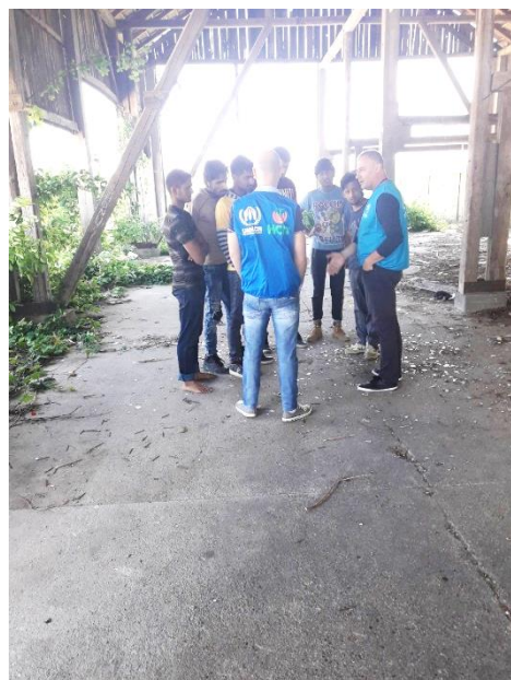
Counselling refugees/migrants sleeping rough in the northern border areas, @HCIT, 14 May 2018