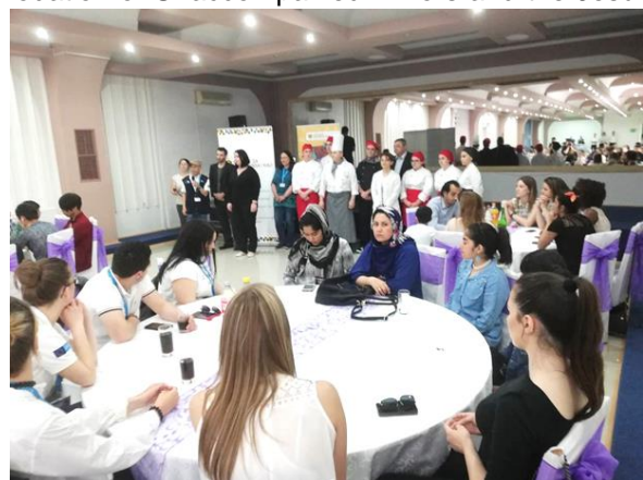
Community cohesion event “At the same table” in Kikinda, @SOS CV, 24 April 2018