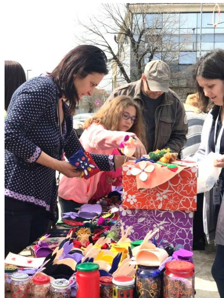
Easter bazaar featuring refugee women handicraft, Pirot, 6 April 2018