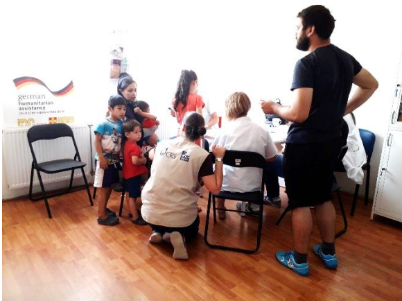
MMR Vaccination in Adaševci Transit Centre, 10 June 2018

■ 151 new infants (under 2) accessed UNICEF-supported mother and baby care services, including health and nutrition services, since the beginning of 2018.