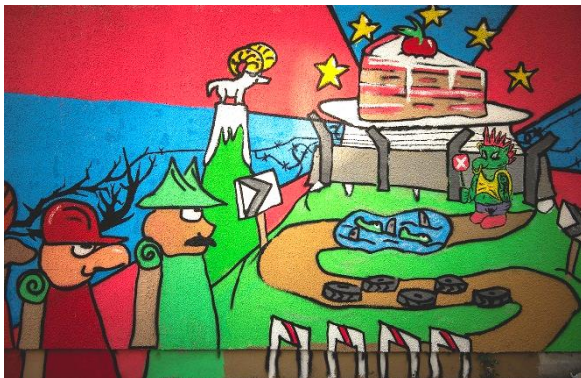
Mural in Miksalište, Belgrade, produced jointly by refugees/migrants and local art students, @Philanthropy, June 2018

combat against modern slavery in a context where trafficking networks target not only traditional VoTs but also especially vulnerable individuals from amongst the population of refugees and migrants. The main project activities focus on (I) strengthening direct services to VoTs, (II) capacity building of service providers for early identification and provision of specialized services to VoTs, and (III) technical assistance to institutions to strengthen the strategic framework and the counter-trafficking mechanism. In the scope of this project, Atina's mobile teams started covering Vranje, Subotica, Novi Sad, Niš,