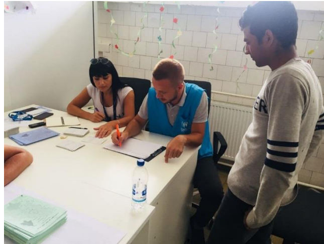
Profiling of arrivals to Bujanovac Reception Centre, August 2018