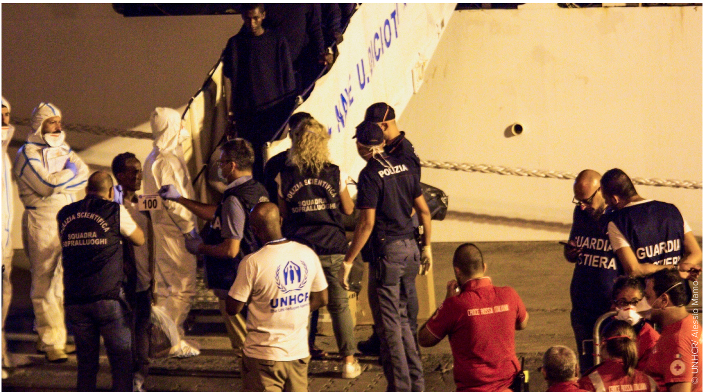
Staff from UNHCR and IOM help 150 refugees and migrants disembark the Italian Coast Guard ship, Diciotti, in the port of Catania after a 10 day stand-off.