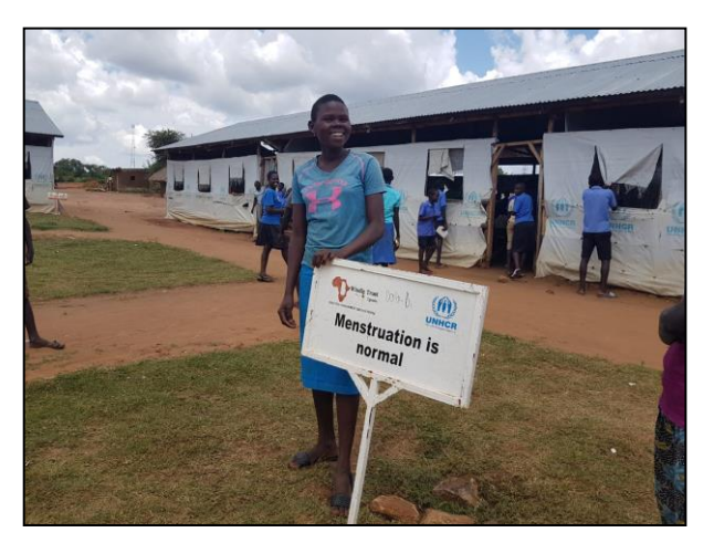
Menstruation Matters: Missing School : In Uganda, the stigma of menstruation, a low level of awareness among girls, boys and the wider community, lack of sanitation facilities, affordability of menstrual supplies and access to accurate information can lead to an adolescent girl missing school. Four to five school days each month equates to as much as 20% of the academic year intentionally lost due to menstruation. This means, per term, a girl child student may miss up to eight (8) days of study.

School absenteeism can lead to poor academic performance and learning achievement and heightens the risk of drop out. This, in turn, can increase an adolescent girl's risk to the likelihood of early initiation to sex with associated risks of HIV, early pregnancy, teenage pregnancy with its associated maternal health complications,