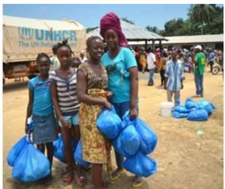
(L) NFIs in preparation for the distribution; (R) Some of the beneficiaries

www.unhcr.org Operational Portal Facebook 3