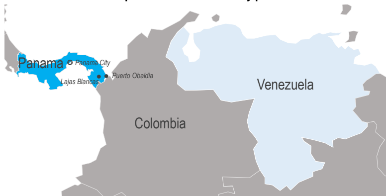
Map 8: Panama – Main entry points

This map is stylized and not to scale. It does not reflect a position by UNICEF on the legal status of any country or area or the delimitation of any frontiers.