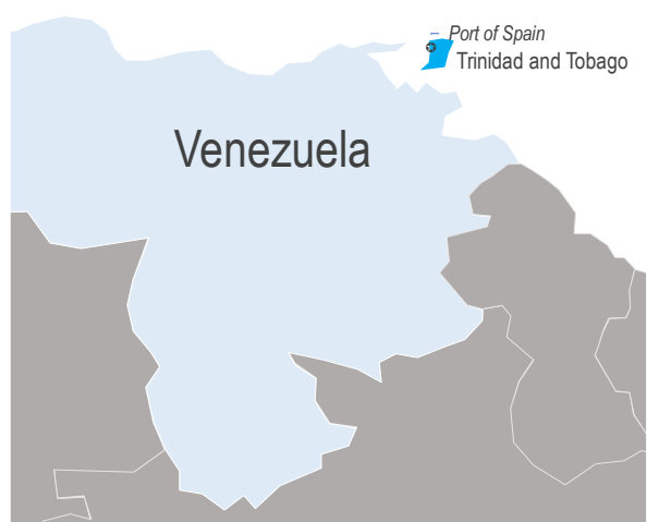
Map 5: Trinidad and Tobago – Locations receiving migration influx

This map is stylized and not to scale. It does not reflect a position by UNICEF on the legal status of any country or area or the delimitation of any frontiers.