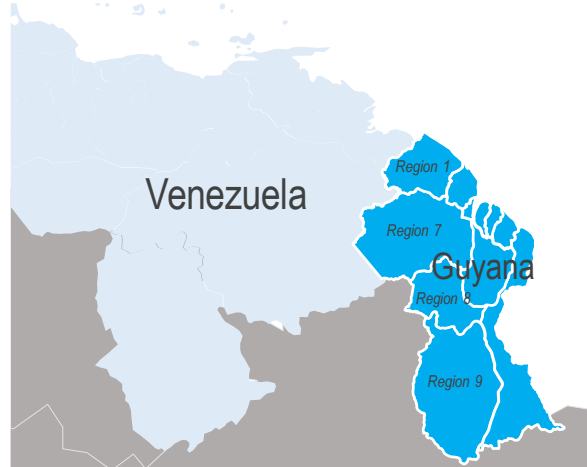
Map 4: Guyana – Regions receiving migration influx

This map is stylized and not to scale. It does not reflect a position by UNICEF on the legal status of any country or area or the delimitation of any frontiers.