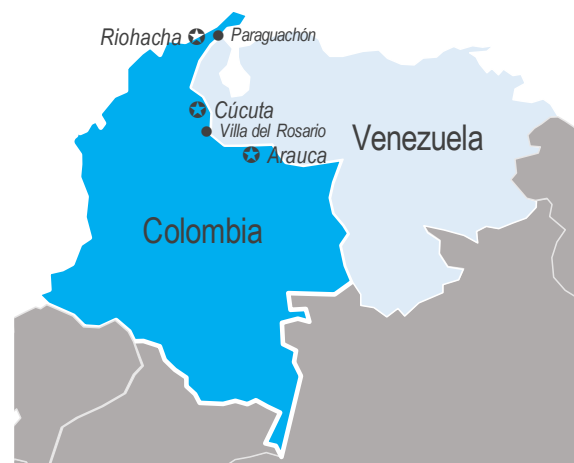
Map 1: Colombia – Main locations receiving migration influx

This map is stylized and not to scale. It does not reflect a position by UNICEF on the legal status of any country or area or the delimitation of any frontiers.