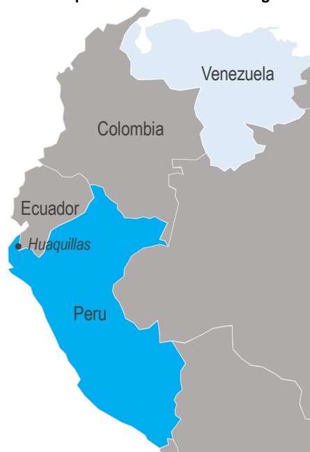
Map 7: Peru – Border crossing

This map is stylized and not to scale. It does not reflect a position by UNICEF on the legal status of any country or area or the delimitation of any frontiers.