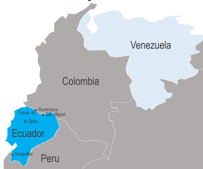
Map 6: Ecuador – Border crossings and locations receiving migration influx

This map is stylized and not to scale. It does not reflect a position by UNICEF on the legal status of any country or area or the delimitation of any frontiers.