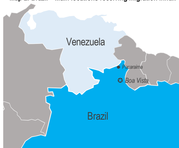
Map 2: Brazil – Main locations receiving migration influx

This map is stylized and not to scale. It does not reflect a position by UNICEF on the legal status of any country or area or the delimitation of any frontiers.