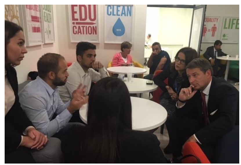
Consulting Roma youth activists on inclusion projects, © UNHCR, Belgrade 29 Oct 18