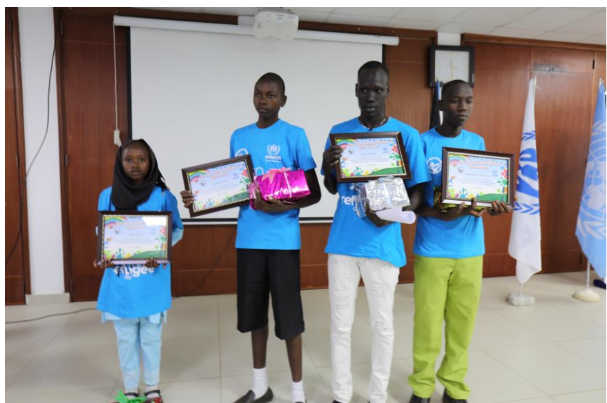
Winners of "We stand with Refugees" drawing competition display their gifts and certificates