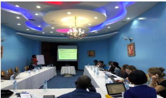
Meeting to validate the findings of the Inter Agency SGBV Assessment findings