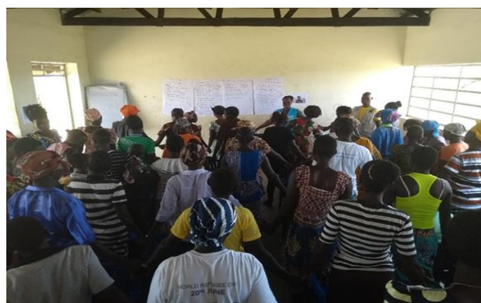
Training on Women Participation and Leadership in Imvepi Settlement, Arua