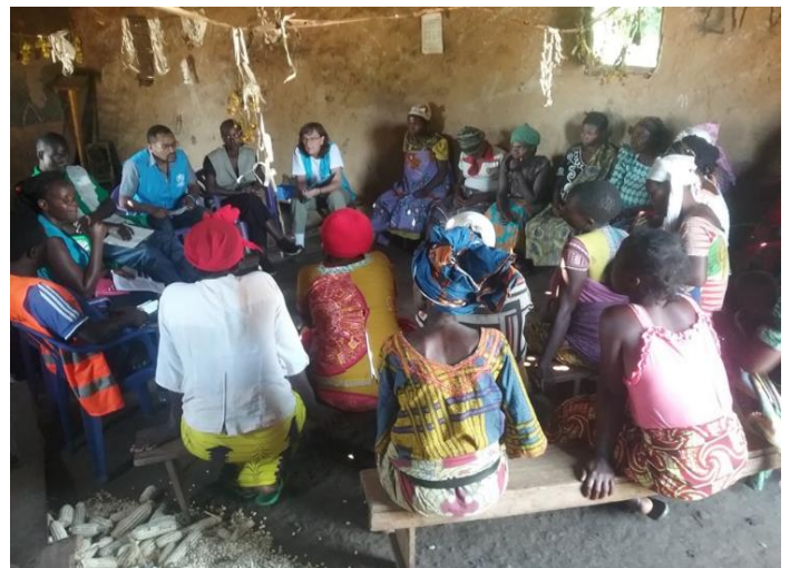
UNHCR staff conducting FGD in Nyamiganda, Kyangwali as part of the SGBV mainstreaming Project.

other service providers, reaching in total 899 beneficiaries. In addition to this, as per the Arua Action Plan developed in May 2017, UNHCR organized and facilitated refresher COC and PSEA TOT trainings reaching 56 participants from Imvepi, Rhino and Lubule settlements including OPM and partners (IPs and Ops). Participants signed (or resigned) the Code of Conduct, discussed how to report cases of PSEA in their respective settlements, learned of their rights from sexual exploitation and abuse and the consequences of misconduct. SGBV mainstreaming project: The project aimed at promoting socio – economic development of survivors through support with micro- enterprise development and Income Generating Activities was launched in Kyangwali. FGDs were held with women groups in Nyamiganda and adolescent boys in Maratatu by UNHCR in partnership with LWF and AAH.