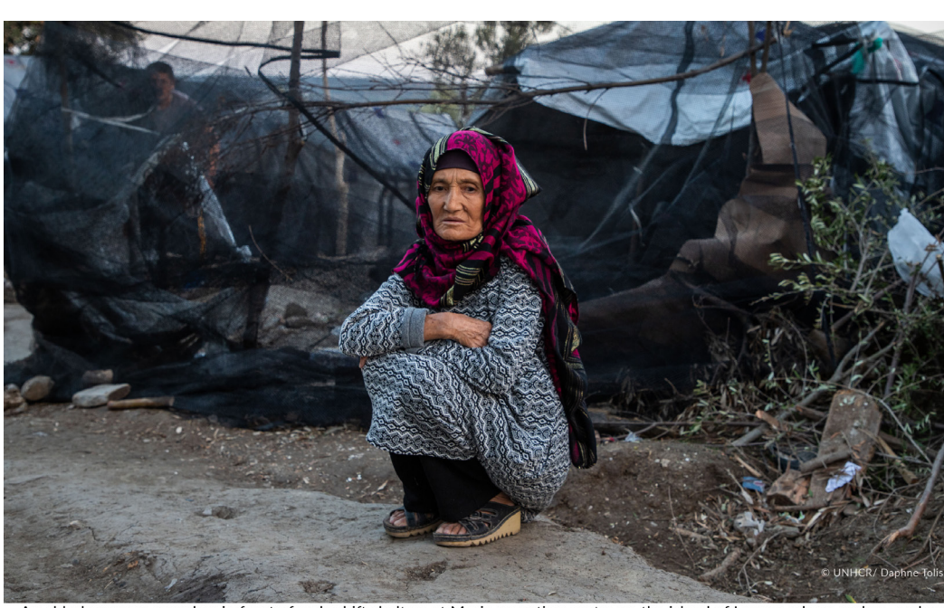
An elderly woman crouches in front of makeshift shelters at Moria reception centre on the island of Lesvos, where asylum-seekers struggle to cope with severe overcrowding, dire living conditions and limited access to basic services, including healthcare.