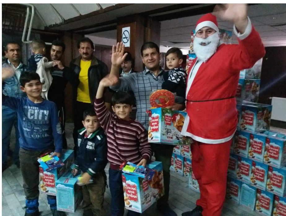
New Year's gift distribution to refugee children in the Reception Centre Vranje, Vranje, Serbia 18 December 2018