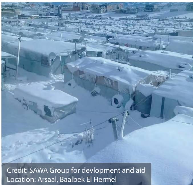
Location: Aarsal, Baalbek El Hermel

Partners involved in the response: MoSA, MOIM, MosDA, UNHCR, UNICEF, GVC, Oxfam, Sawa Group, URDA, SI, DAF, Medair, SCI, DRC, ACF, WVI, RI, NRC, MSAs, Mayors, Refugee Outreach Volunteers.