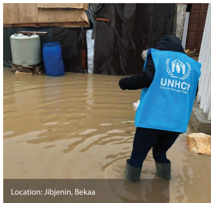
Location: Jibjenin, Bekaa

• Referrals are being received through partners, the call centre and hotline. All individual referrals are assessed through a rapid phone assessment and followed up.